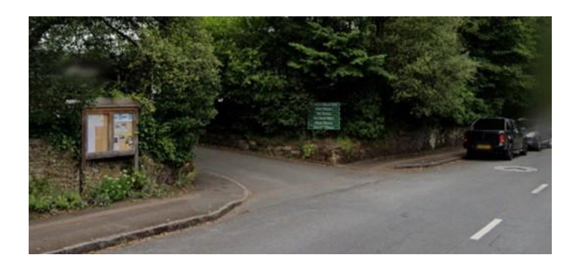
Photo, showing entrance, leading to Limpsfield Fitness car park (opposite the church)

Oxted Runners will be hosting this run, with a trail route, likely to be on Limpsfield Chart, about five miles in distance. As in previous years, there will be different pace leaders, so you will be able to run at a pace that is comfortable for you.